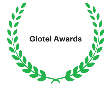
Digital Transformation Innovation 2021, Finalist

25 external teams leveraging the Open Ecosystem capabilities